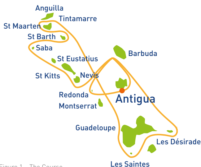
Figure 1 – The Course

Please see "Figure 1 – The Course" below for an overview of the course. Detailed instructions will be available in the Sailing Instructions and on the RORC Caribbean 600 Minisite ( caribbean600.rorc.org ).